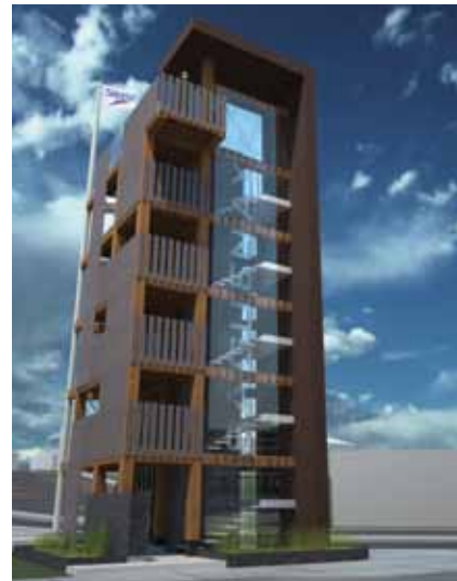
PROJECT UNDER DEVELOPMENT