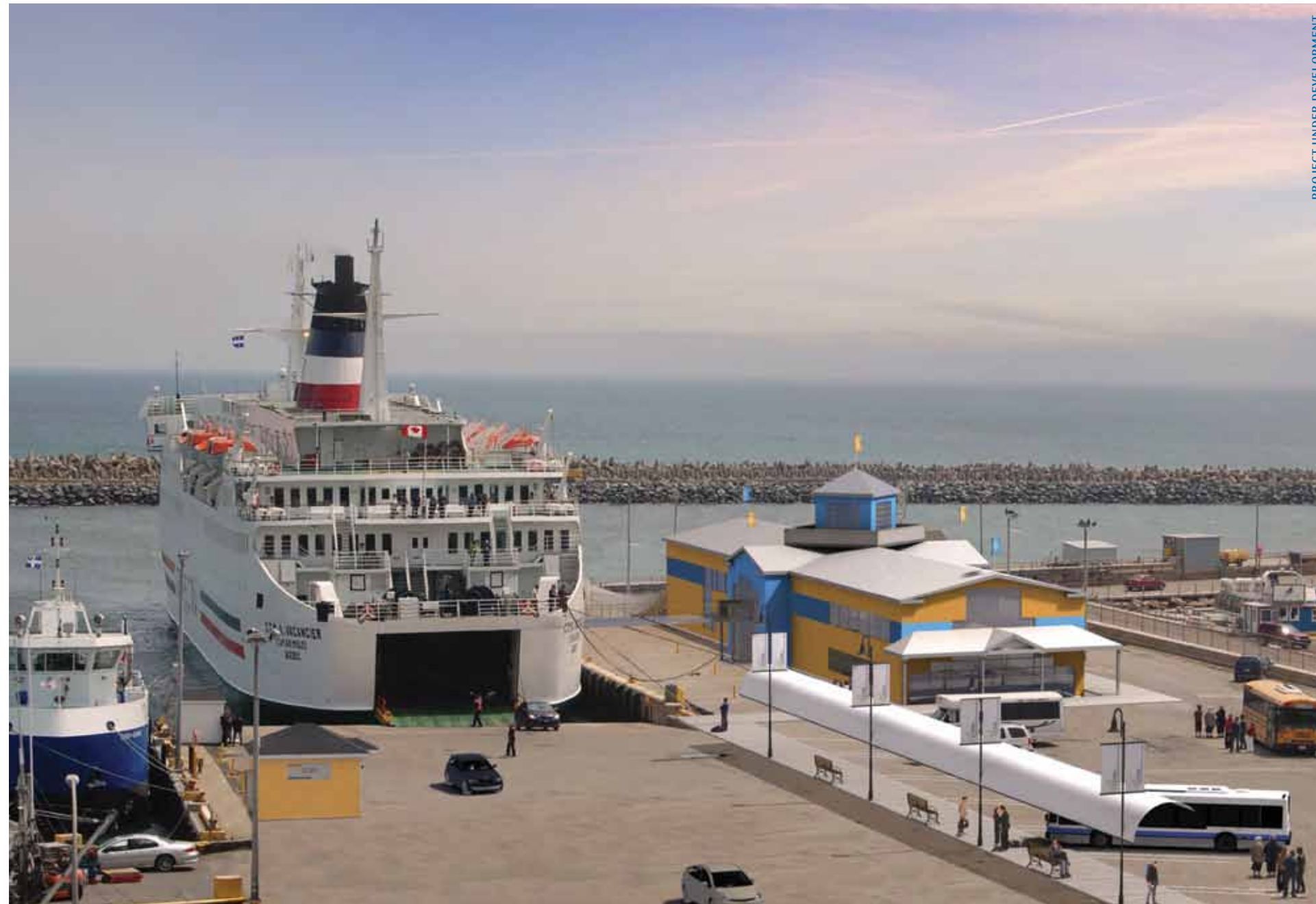
PROJECT UNDER DEVELOPMENT

INVESTMENTS TOTTALLING IN EXCESS OF $15 MILLION HAVE BEEN MADE OR ARE UNDER WAY WITH A VIEW TO ENHANCING LOCAL TOURIST SUPPLY.