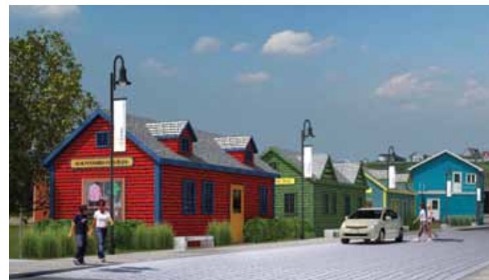
PROJECT UNDER DEVELOPMENT