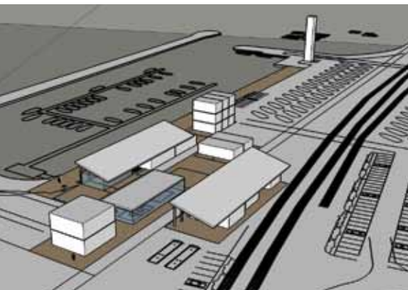
PROJECT UNDER DEVELOPMENT