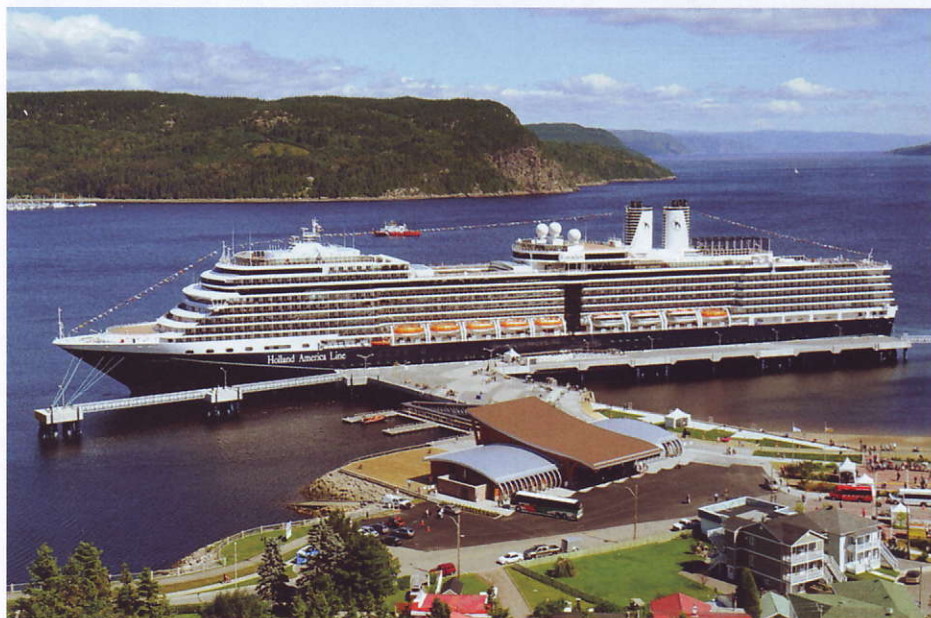
The Eurodam participated in the official opening of Saguenay's new cruise terminal on Sept. 4, 2009.

MSC will sail the Poesia to Canada and New England for six weeks, starting in September 2010, offering 10-day as well as seven-day cruises between New York and Quebec. The cruises are designed both for North American and European passengers, according to Palomba.